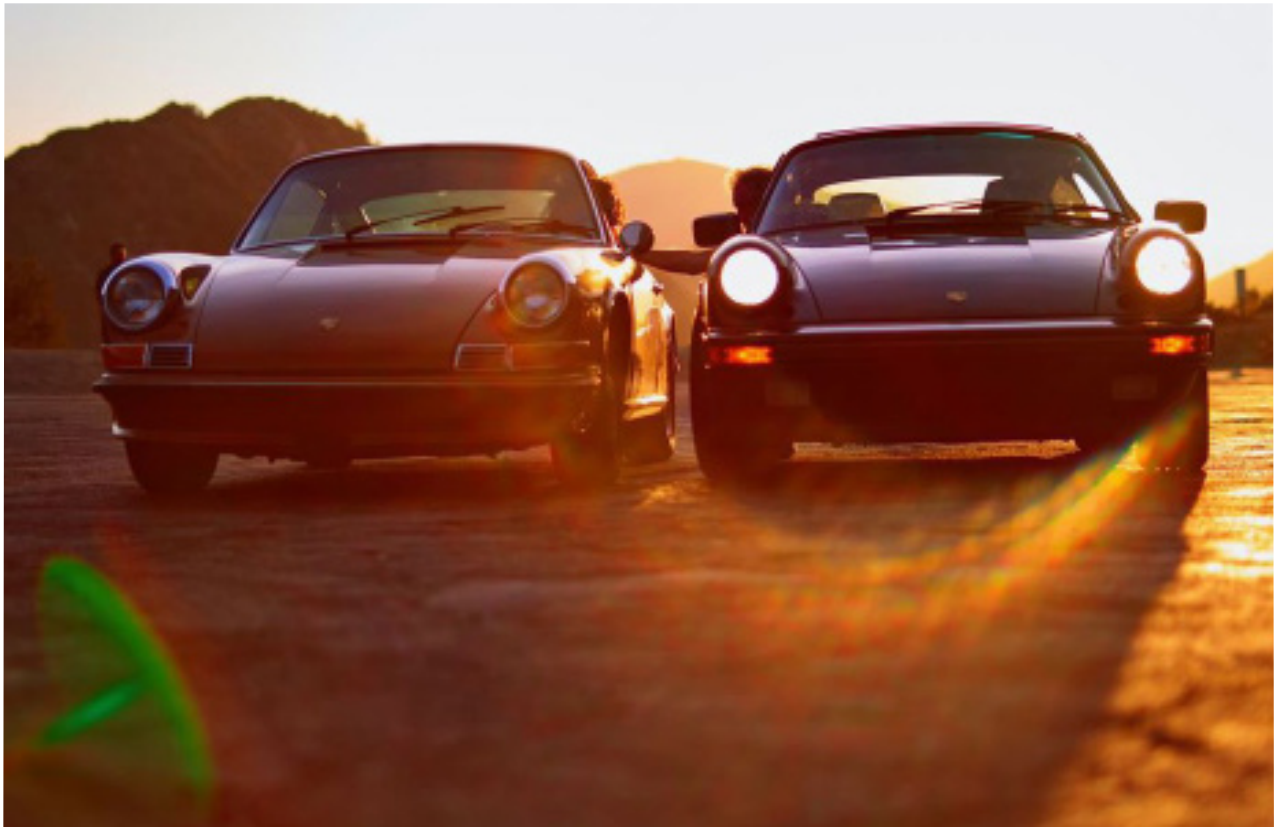
BLACKWING 7 S-Tuned 57mm with SKIN.